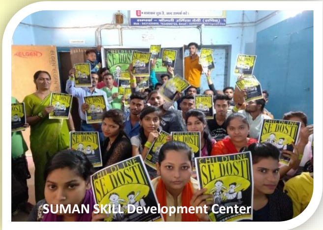
SUMAN SKILL Development Center