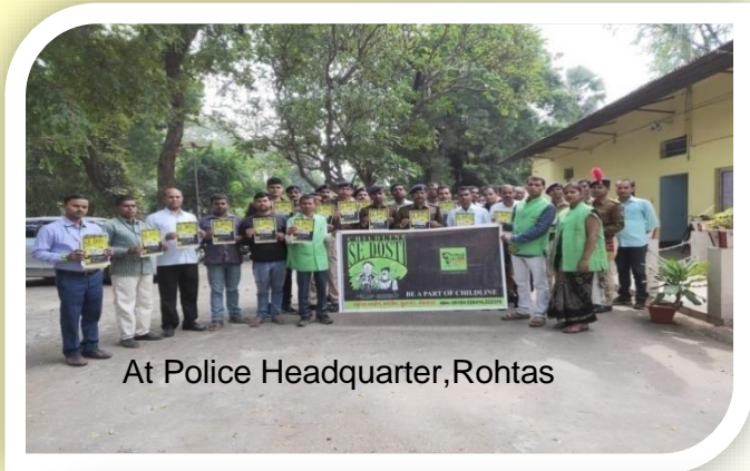
At Police Headquarter, Rohtas