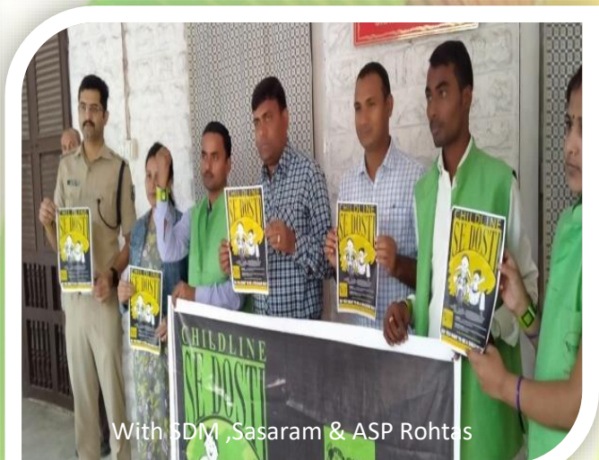
With SDM, Sasaram & ASP Rohtas