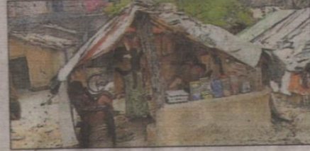
शहर के बंदा स्थित रेड लाइट एरिया।

सूची जिला बाल संरक्षण इकाई को उपलब्ध कराया जाएगा।