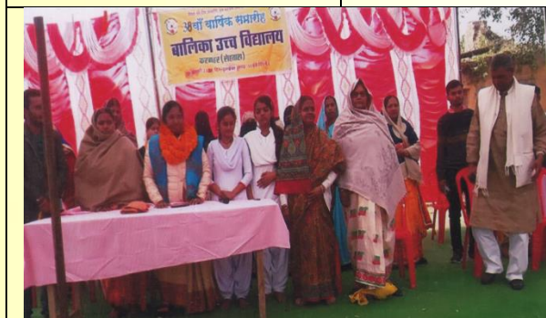
38 th Annual Function of the School