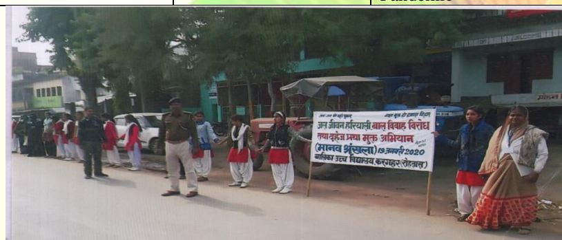
Participation in Human Chain