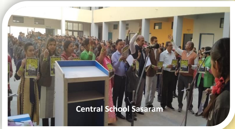
Central School Sasaram

ii. Banner display : 25 Banners were displayed at different places