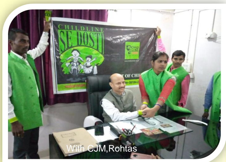
With CJM, Rohtas

Coverage: DALSA, Distt and Sessions Judge, CJM, District Magistrate, SP. 8 Police Stations ,GRP, Sasaram, RPF, Sasaram, CS Rohtas, DEO, Rohtas, Central School Sasaram, GHS Karghar, Kasturba Vidyalay Karghar, SUMAN Kaushal Vikas Kendra Dalmianagar, Kasturba Vidyalay ,Nokha ,Bal Groh Sasaram.etc