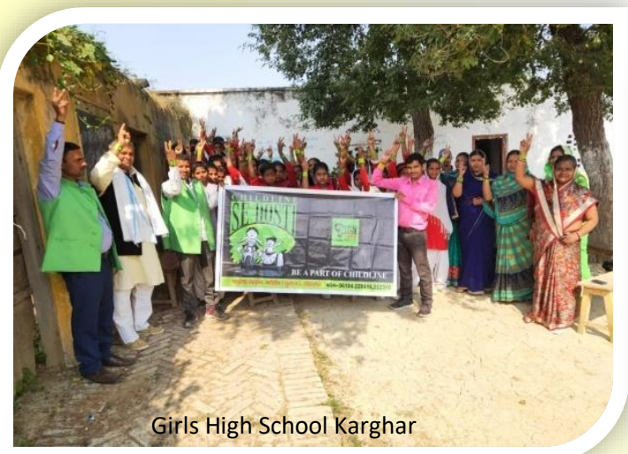
Girls High School Karghar

ii. Banner display : 25 Banners were displayed at different places