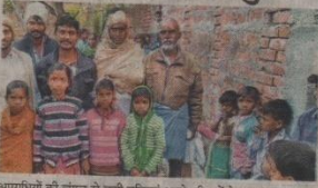
अपहरणकर्ताओं के चंगुल से छुटकारा पाए गए बच्चों के साथ परिवार के सदस्य।

थाना क्षेत्र के पूर्वी दोरसन गांव के ग्रामीणों में करीब चार बच्चों को स्कूलों से अपहरण करने के बाद भी शहर के अपहरणकर्ताओं ने पीछा कर 4 करोड़ रुपए के अपहरणकर्ताओं के चंगुल से छुटकारा पाया।